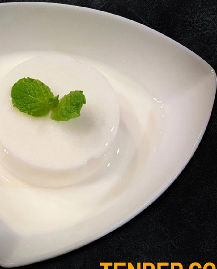
TENDER COCONUT PUDDING